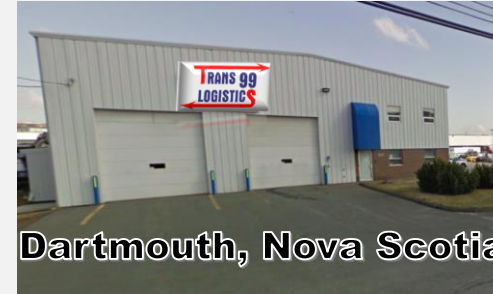
Dartmouth, Nova Scotia