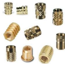
Inserts for Plastics