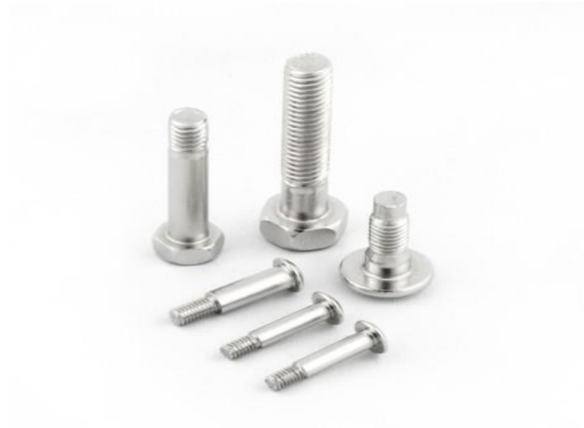
Threaded products, indented hex bolts, shoulder screws, etc.