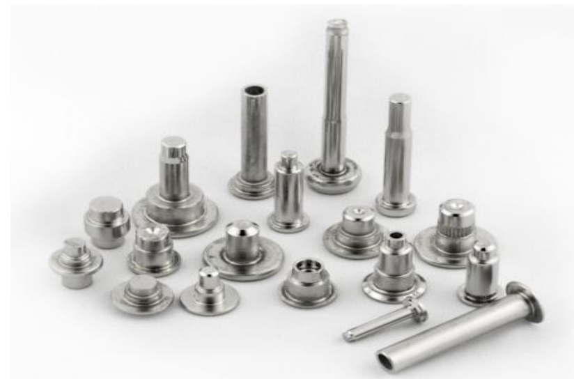
Shoulder rivets, stanchion rivets, shoulder semi-tubular, 4 step rivets & short length shoulder rivets