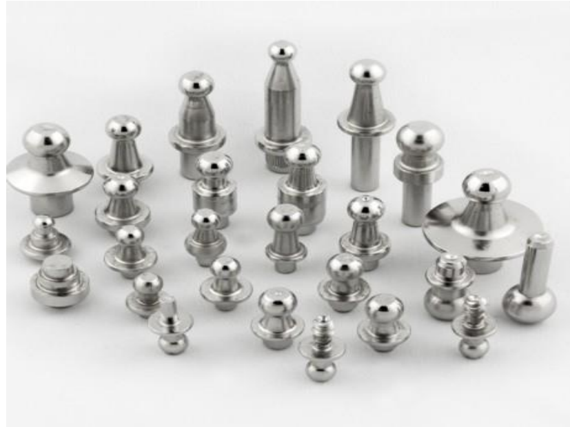
Automotive ball studs for all gas strut lift assist applications