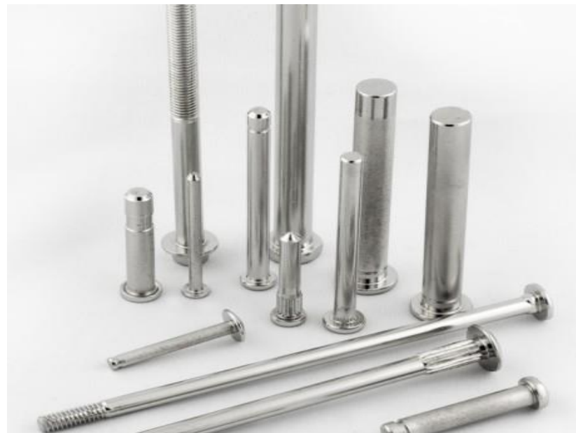
Long length small diameter pins with threading, grooving, pointing and knurling