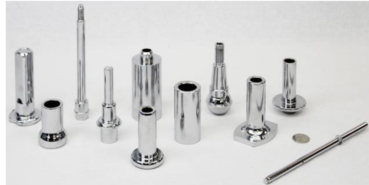
Long Diameter Long Stroke