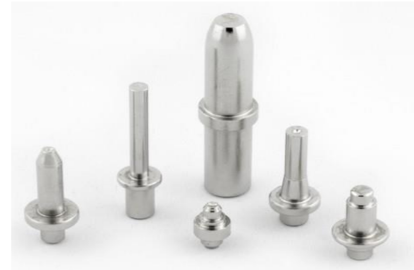
Collar studs, double ended, stand off studs