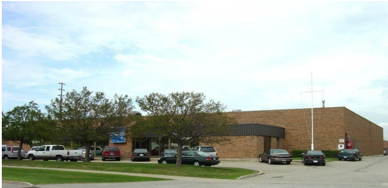
326 Humber 48,000 S.F.