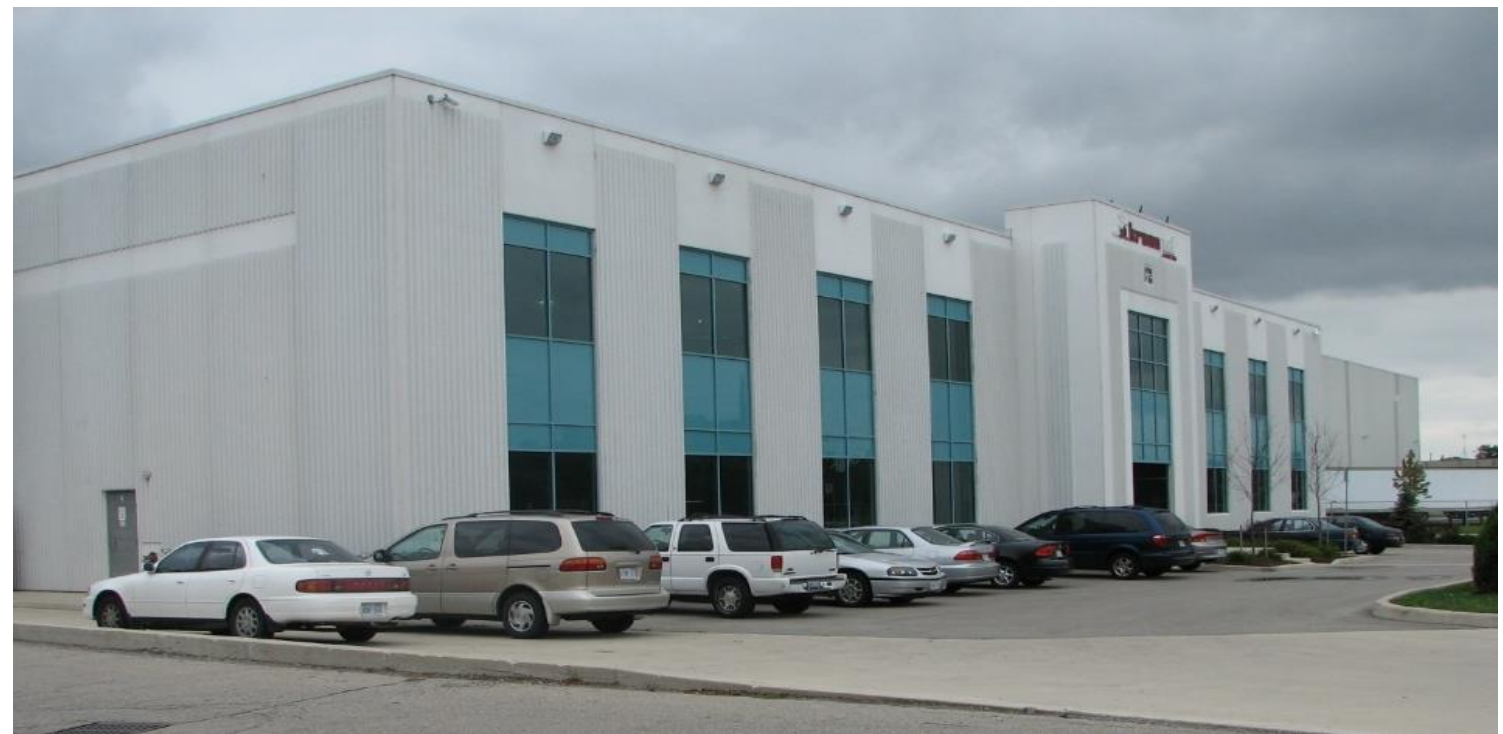
312 Humber 51,000 S.F.