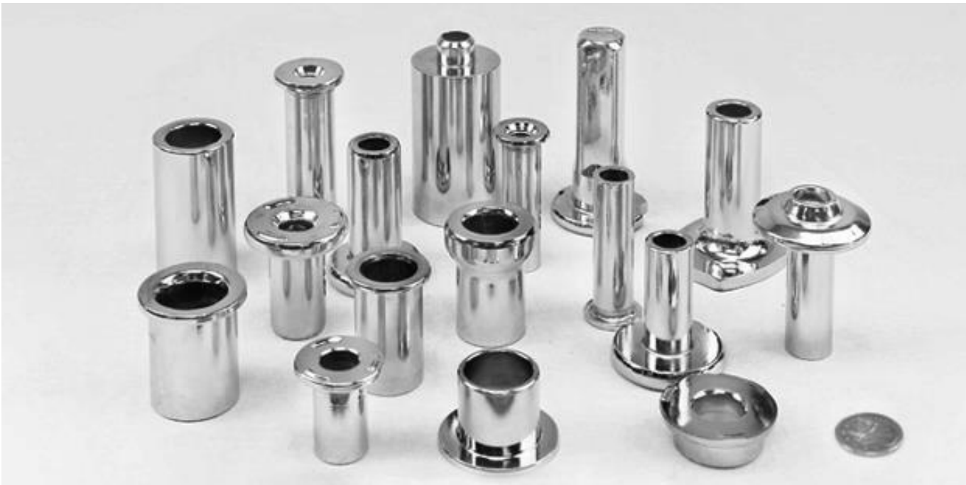
Bushing & Sleeves