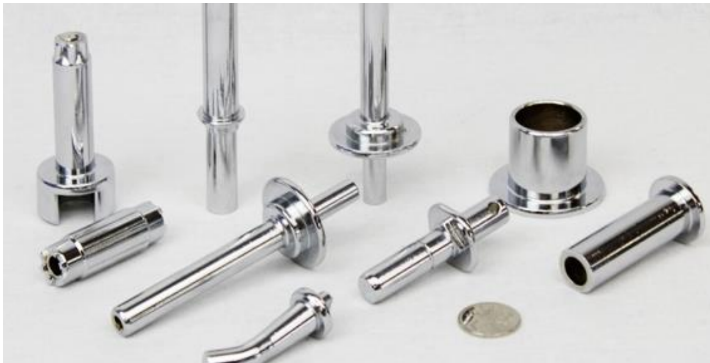
Cold Headed Secondary Operations