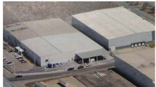
/ Automotive Valve Production