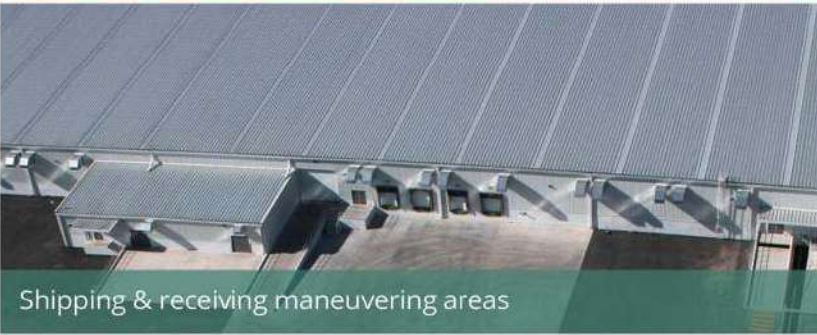
Shipping & receiving maneuvering areas