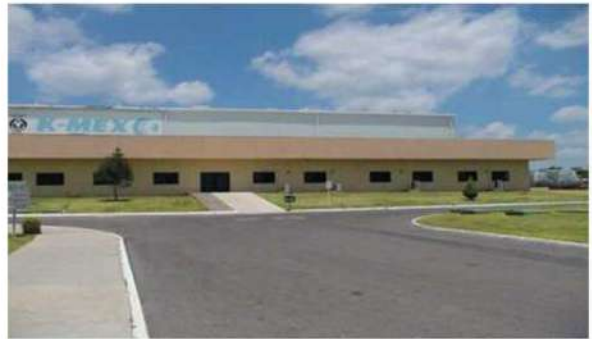
/ Office Expansion