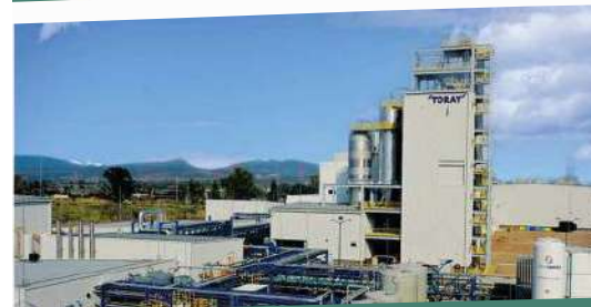
Toray - El Salto, Jalisco