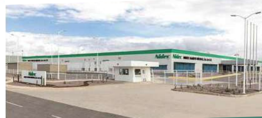
Nidec Sankyo - San Luis Potosi, SLP

Our experience and knowledge in market analysis, feasibility studies, financial arrangements, sales, operation and property maintenance has allowed us to build resorts, residential condominiums and high-quality rental office buildings.