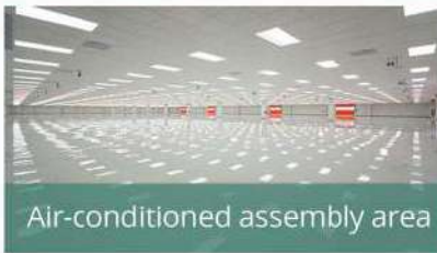
Air-conditioned assembly area