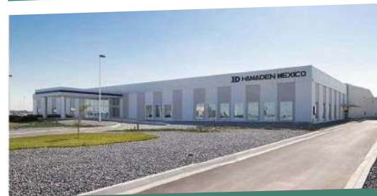
Hamaden - Monterrey, N.L.