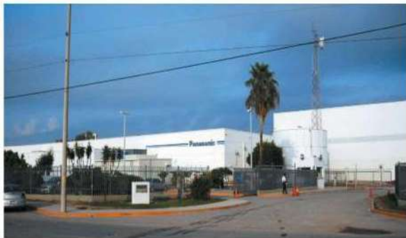
/ New Warehouse