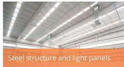
Steel structure and light panels