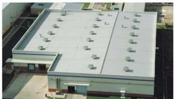
/ Texas New Plant