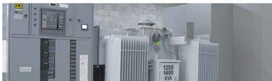
Medium Tension Substation