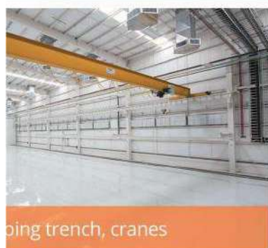
loading trench, cranes