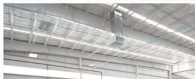
HVAC Systems ducting, electromechanics intallat