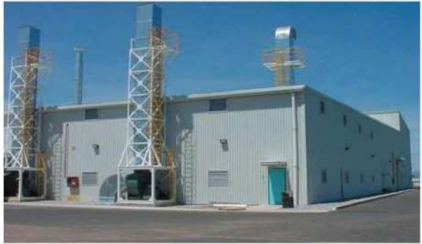
/ Paint Line Expansion