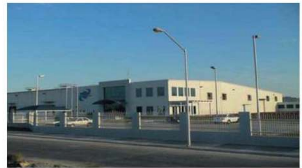
/ Production New Plant