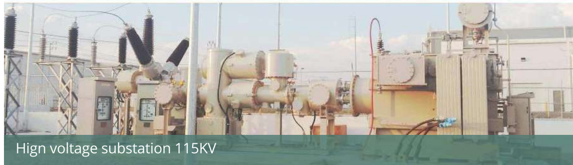
High voltage substation 115KV