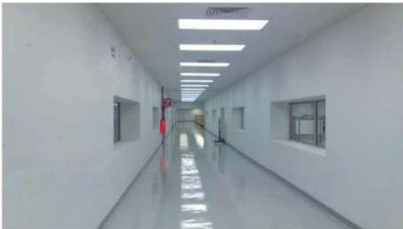
/ Production area renovation (Clean Room Type)