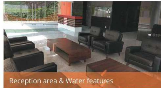
Reception area & Water features