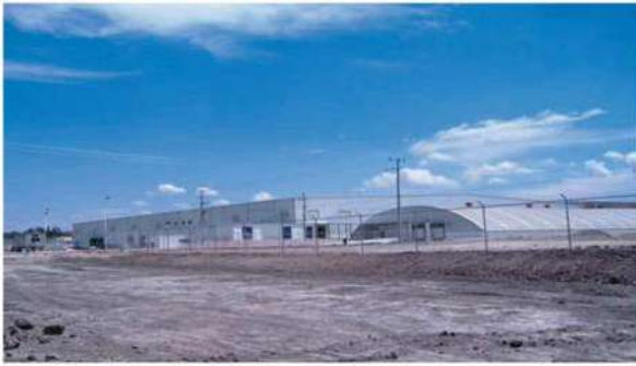
/ Autopart Warehouse