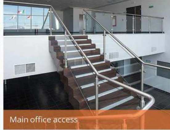
Main office access