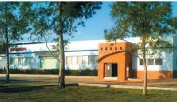
/ Purchase Center / MS Warehouse expansion