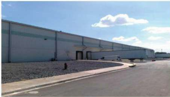
/ Warehouse Building Expansion