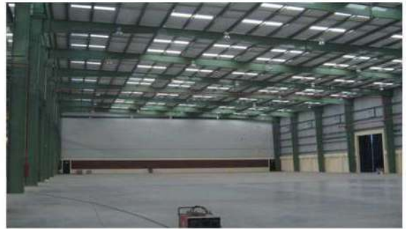
/ Motorbikes Factory Expansion