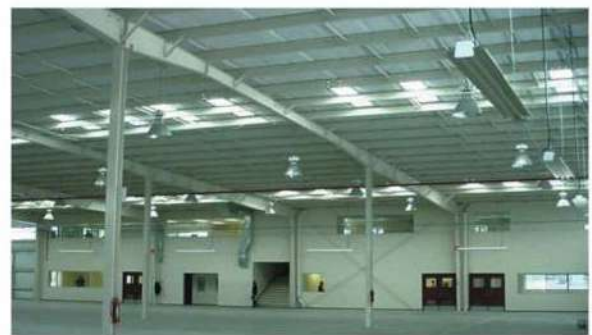
/ New Fabrics Warehouse