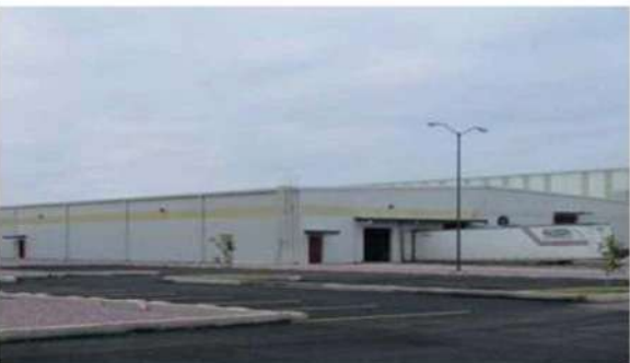
/ New Production Warehouse