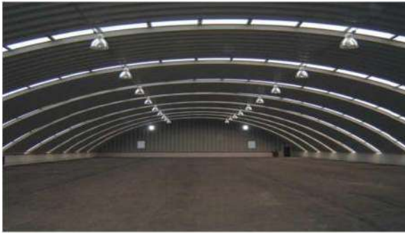
/ Motorbikes Storage