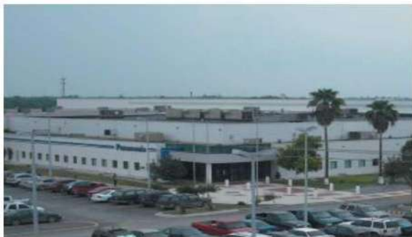
/ New Locker Rooms & Parking lot