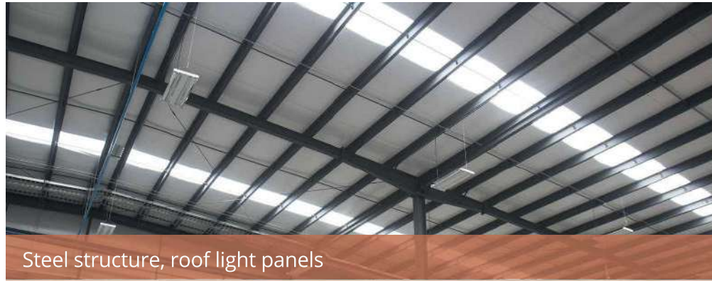
Steel structure, roof light panels