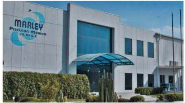
/ Office Area Facade