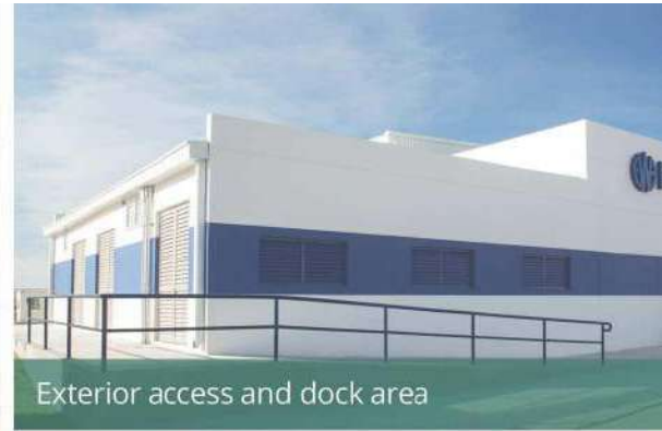
Exterior access and dock area