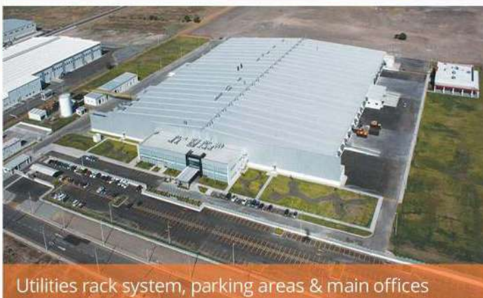
Utilities rack system, parking areas & main offices