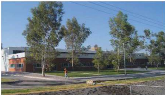
/ Training Center