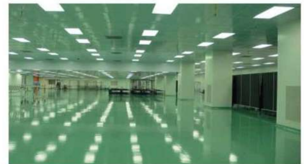
/ Production Plant & Class 10,000 Clean Rooms

Playas de Rosarito, Baja California Norte