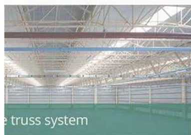
e truss system