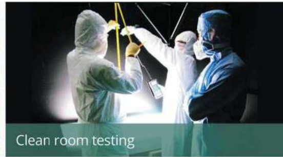
Clean room testing