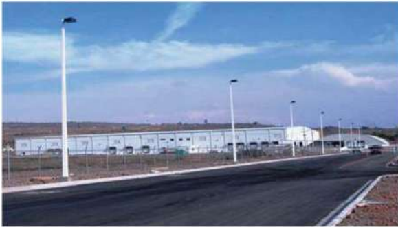
/ Autopart Warehouse