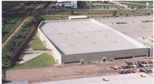
/ New Sewing Plant