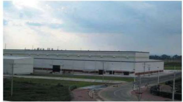
/ Motorbikes Factory Expansion