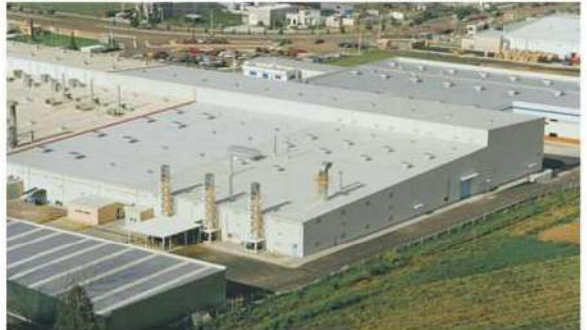
/ Paint Areas Expansion