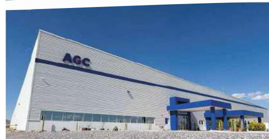
AGC - San Luis Potosi, SLP