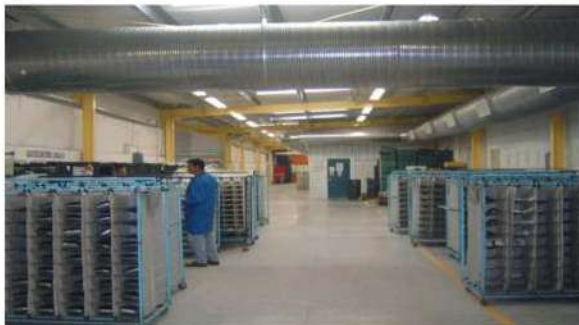
/ Connection Building / Paint Line 6