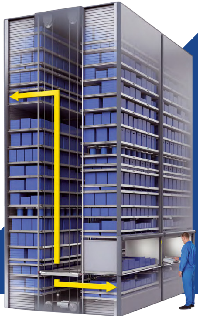
Spotlight Product to Right: The Hänel Lean-Lift® Vertical Lift Module