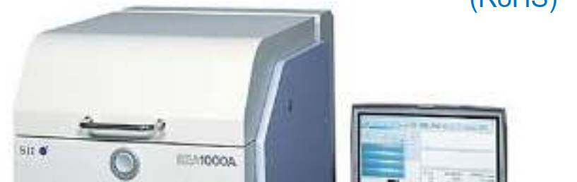
Cross section analyzer