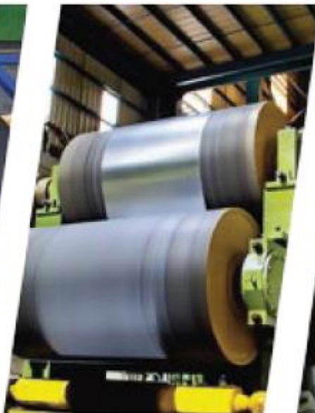
Hot dip galvanized