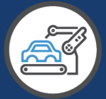
Automotive (non exposed)