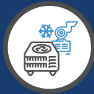
HVAC / R