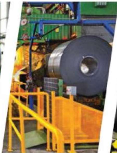
Cold rolling mill