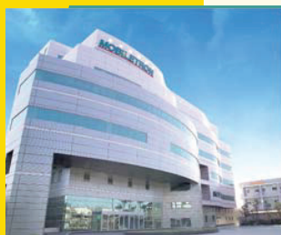
Global Service Center, Taiwan R.O.C.

"To be Respectable, Responsible, Reliable through Research" is the sole goal for Regitar. We promise to provide effective and efficient energy conversion products and services to our customers.