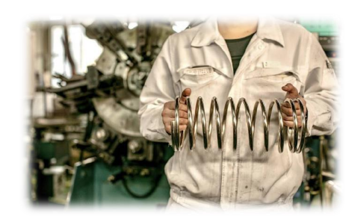
Webpage: www.sankyo-seiki.co.jp/English/home.html www.kumamoto-sankyo-sp.co.jp/