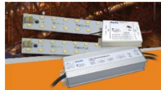
LED Drivers and Modules