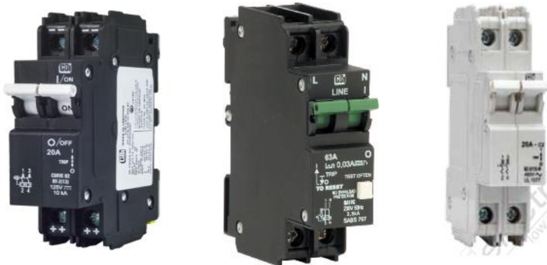
QY 2 POLE (DC) Dual Mount UL489a