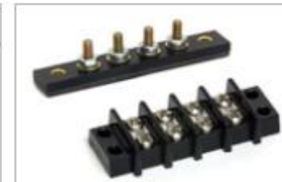
Junction & Terminal Blocks