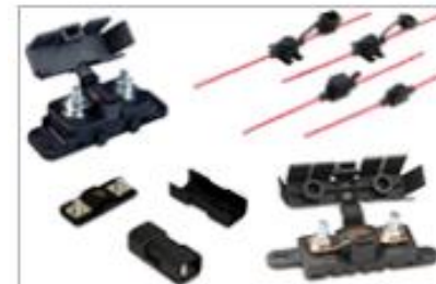
Automotive Fuse Holders