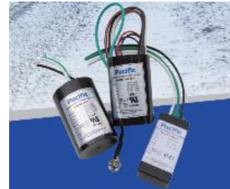
Surge protector devices

Manufacturer of high quality lighting control equipment and related electrical components