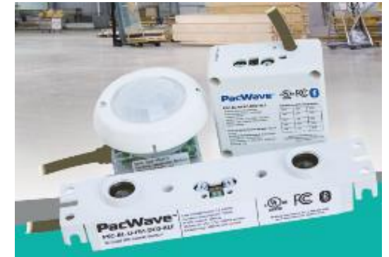
Sensors and Controls