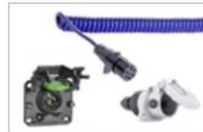
DC Vehicle Connectors

Provider of heavy-duty engineered solutions for their electromechanical switching, power control and circuit protection applications.