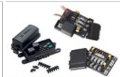
DC Power Distribution Modules