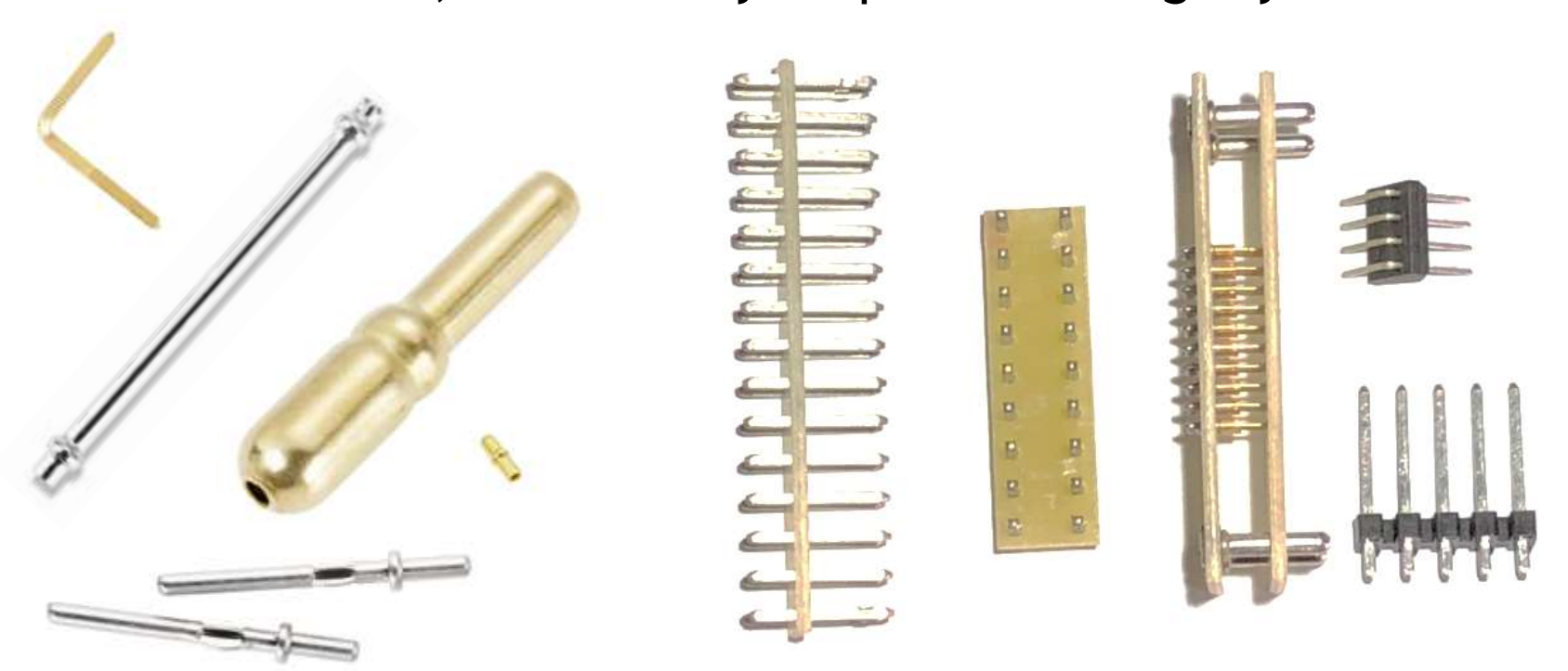
Both electrical or mechanical pins

Whether you need a standard or custom contact pin and headers , we can be your partner and get you there.