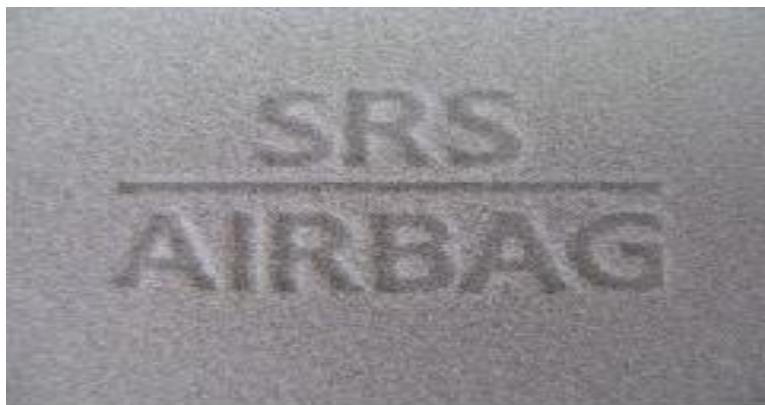
Detail of a B-Pillar from Nissan TIIDA flocked by GF