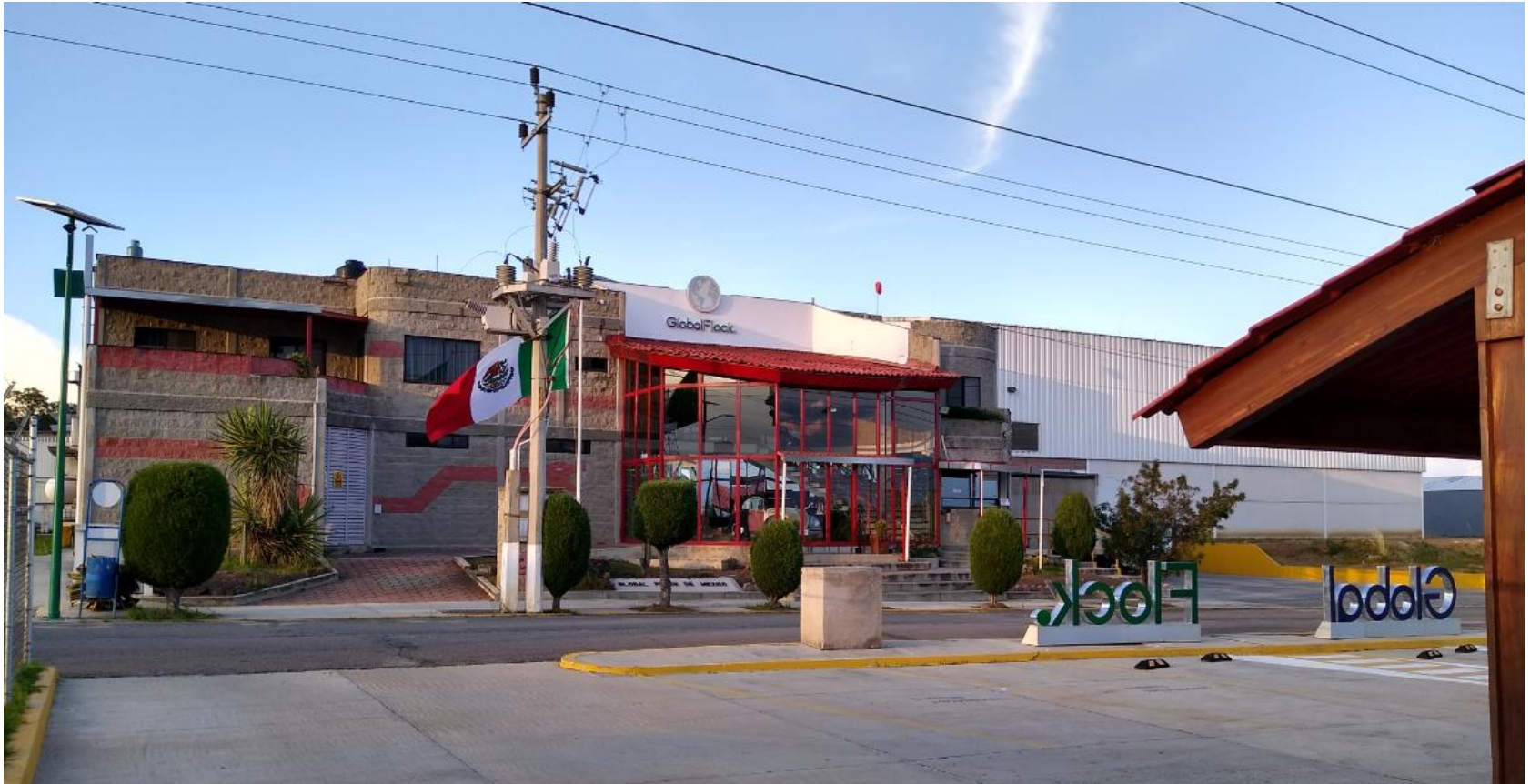
GF Plant in Tetla, Tlaxcala (Central-Mexico)

GF started its operations in June 2009 in order to provide to its customers in North America object-flocking in the best quality available.