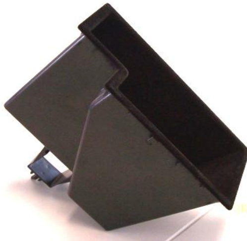
VW New Beetle Jumbo Box