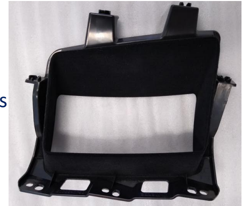
2020 Mazda CX-30 flocked Head-Up-Display frame