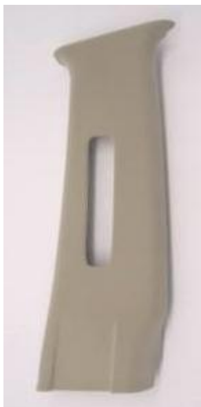
B-Pillar from Nissan TIIDA flocked by GF with PA6.6; 1.7 dtex; 0.5 mm

GLOBAL FLOCK can flock almost any substrate in any geometry, color, size and quantity! GF is the only object-flocker in North-America who can flock with the very smooth Nylon-flock-fiber PA6.6; 1.7 dtex; 0.5 mm as we do in the flocking of pillars in UV-resistant automotive colors.