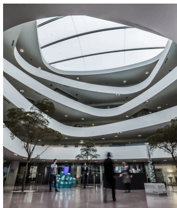
Innovation Headquarters in Linz, Austria