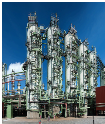
Olefin production in Porvoo, Finland

In re-inventing essentials for sustainable living, we build on our commitment to safety, our people, innovation and technology, and performance excellence. We are accelerating the transformation to a circular economy of polyolefins and expanding our geographical footprint to better serve our customers around the globe.