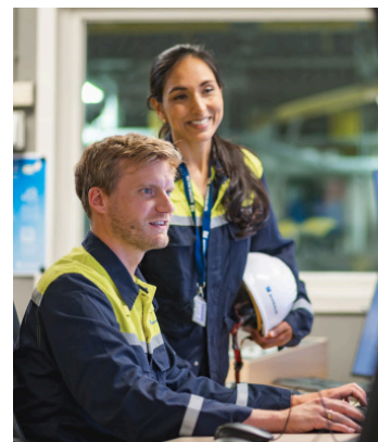
Borealis has 6,200 employees