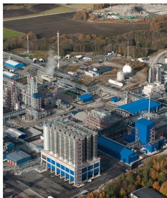
Polyolefin production in Stenungsund, Sweden