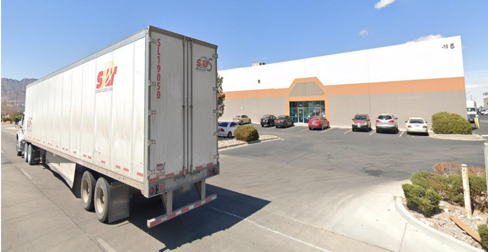
5 founders Blvd. ELP 79906