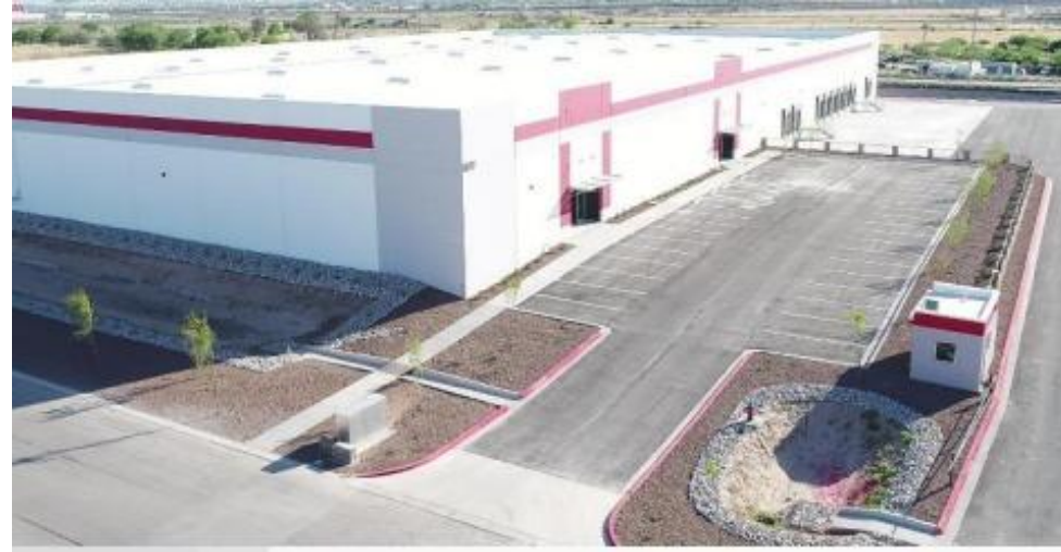
9525 Plaza Circle ELP 79927