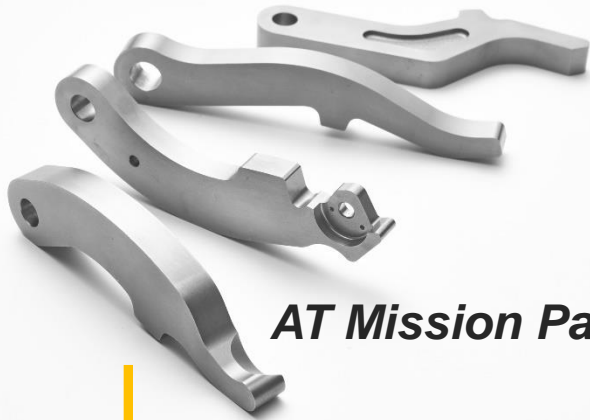
AT Mission Parts