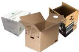
REGULAR SLOTTED CONTAINERS