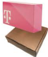
DIE CUT BOXES