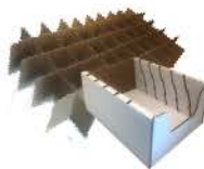
CHIPBOARD PARTITIONS / PADS