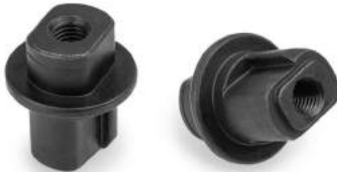
Seat Arbor Special Nut