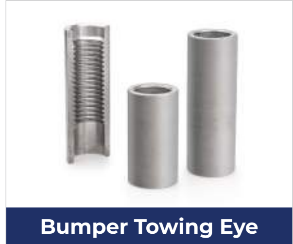
Bumper Towing Eye