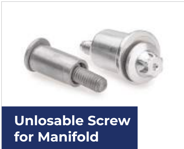
Unlosable Screw for Manifold