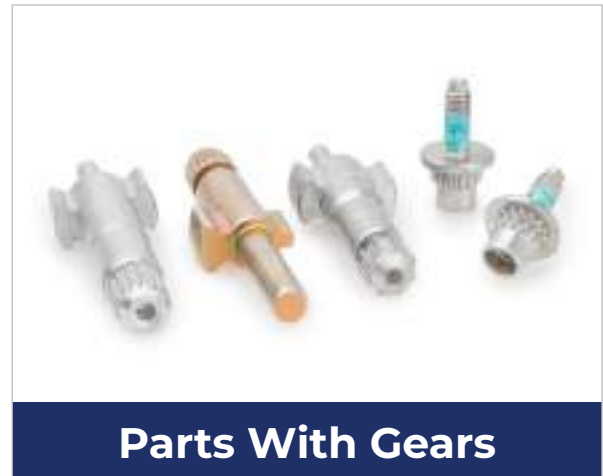
Parts With Gears