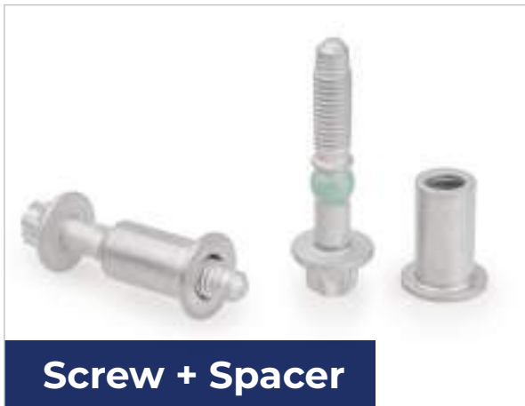
Screw + Spacer

* Previously cold forged + machined, now 100 % cold forged.