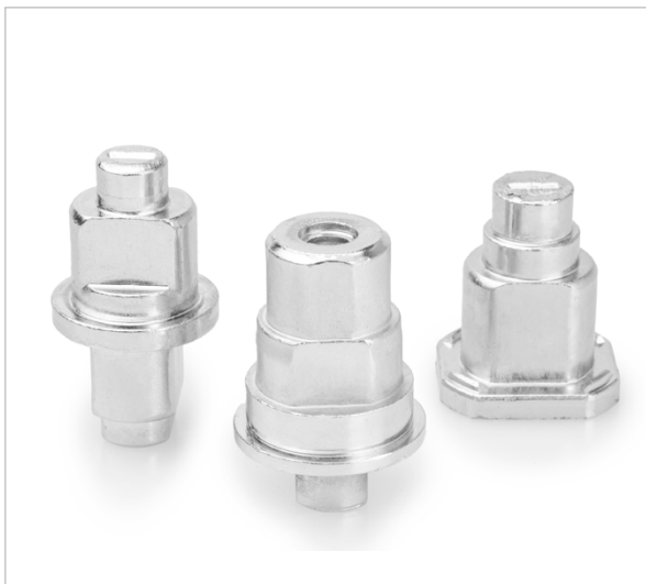
Parts with flat faces