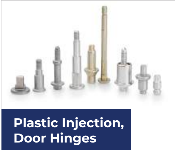
Plastic Injection, Door Hinges

Any special connecting element is interesting for us. The more complex the part, the better for us!