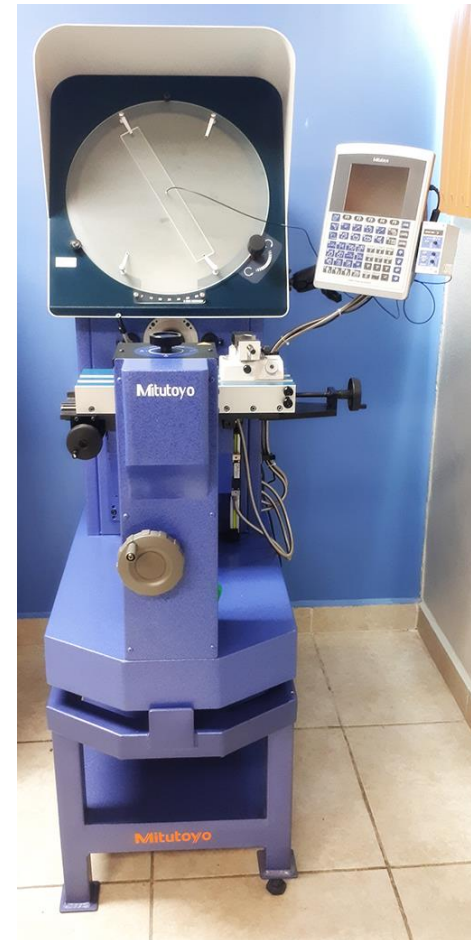
Mitutoyo Optical Comparator Mod. PH-A14