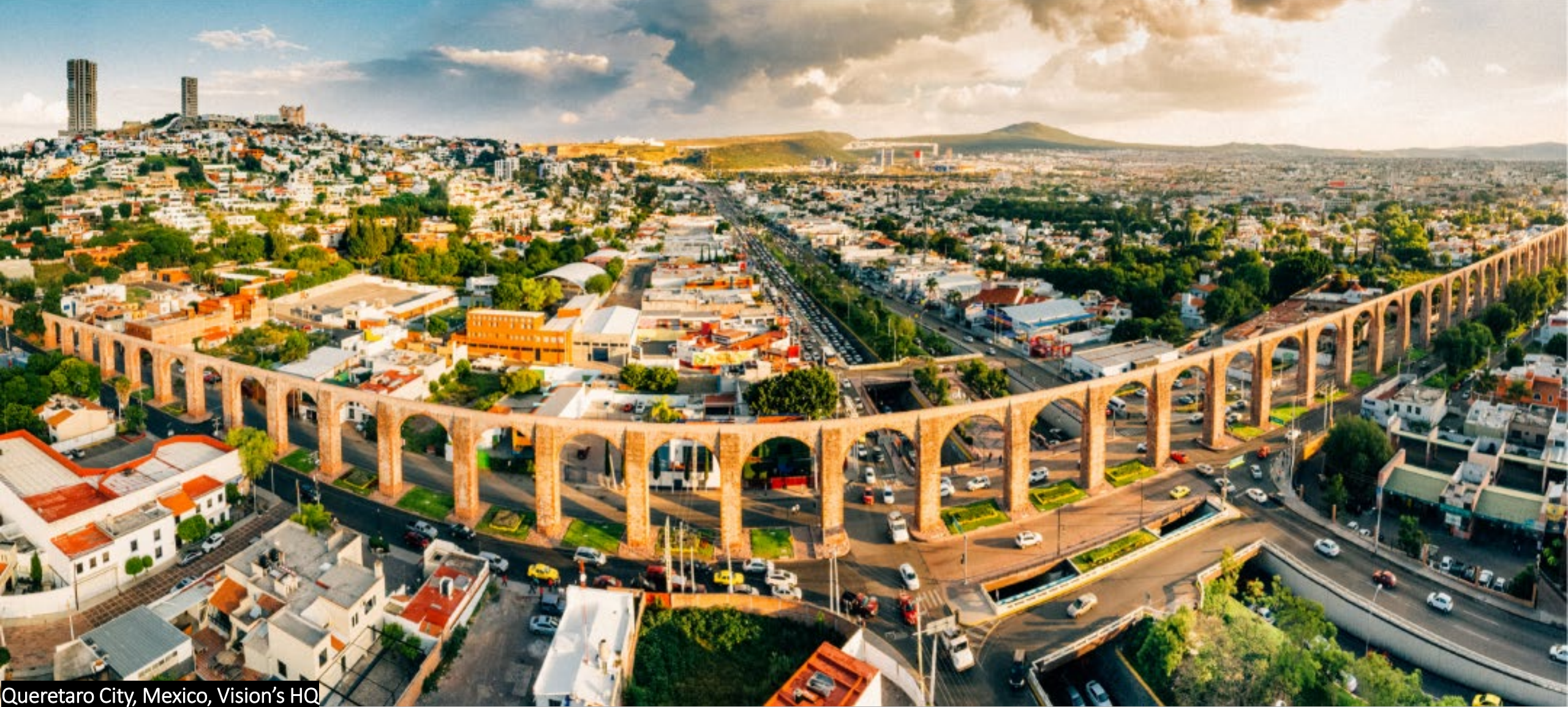
Queretaro City, Mexico, Vision's HQ