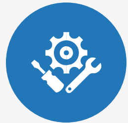
Civil engineering - Pipeline