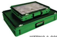
KITTING & SORTING