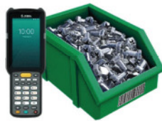
VENDOR MANAGED INVENTORY