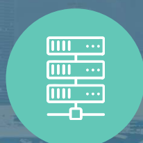
DATA CENTER/ 5G