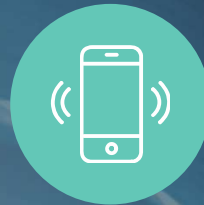
CONSUMER/ MOBILE DEVICES