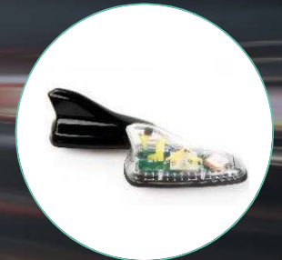
Vehicle Antennas Smart Chargers/ Wireless Chargers / Compensers