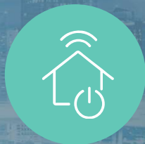
CONNECTED HOME/ HOME APPLIANCE