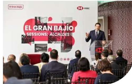
EL GRAN BAJÍO SESSIONS: MAYORS MAY 2023