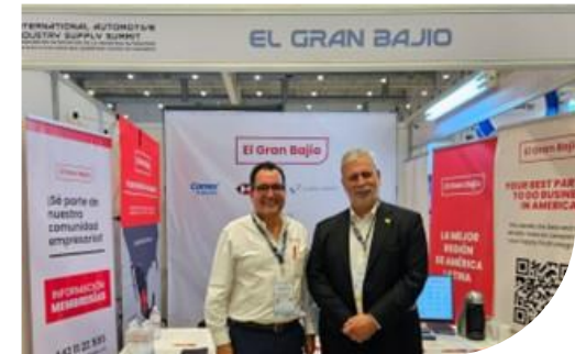
INTERNATIONAL AUTOMOTIVE INDUSTRY SUPPLY SUMMIT MEXICO 2023 JUNE 2023