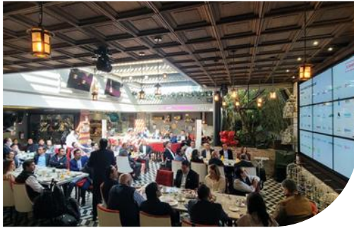
PLASTIC CLUSTER OF QUERETARO FEBRUARY 2023