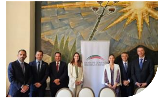
USMCA ITALIAN CHAMBERS MEETING APRIL 2023