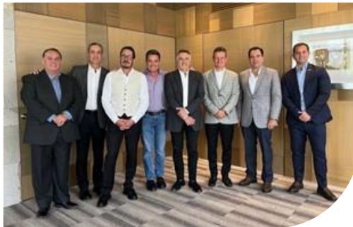
MEETING WITH MICHOACAN'S BUSINESSPEOPLE APRIL 2023