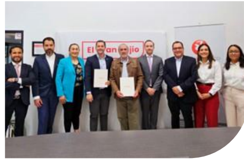
CAN CHAM AGREEMENT SIGNATURE MAR 2023