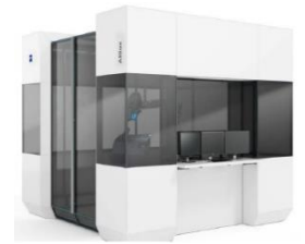
Zeiss Ai Box