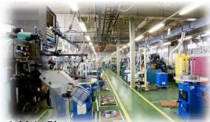
● Main Plant